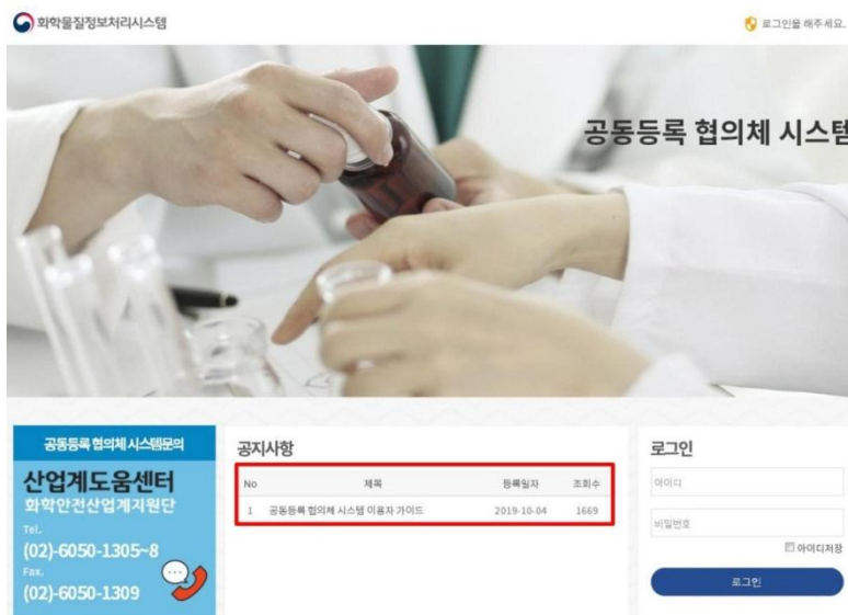
Picture 2: The CICO system main page with link (red frame) to user guidance

And then the following page will open, as shown in the picture below. You can directly access this page via the following link: kreach.me.go.kr/cips/main/INS000101.do .